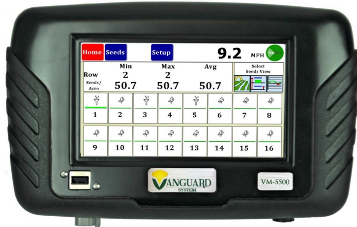
VM-5500 1-16 Rows