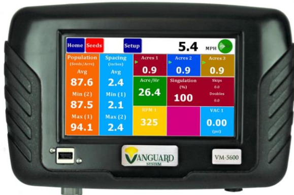
VM-5600 1-32 Rows

View Dashboard or Home screen with bargraphs